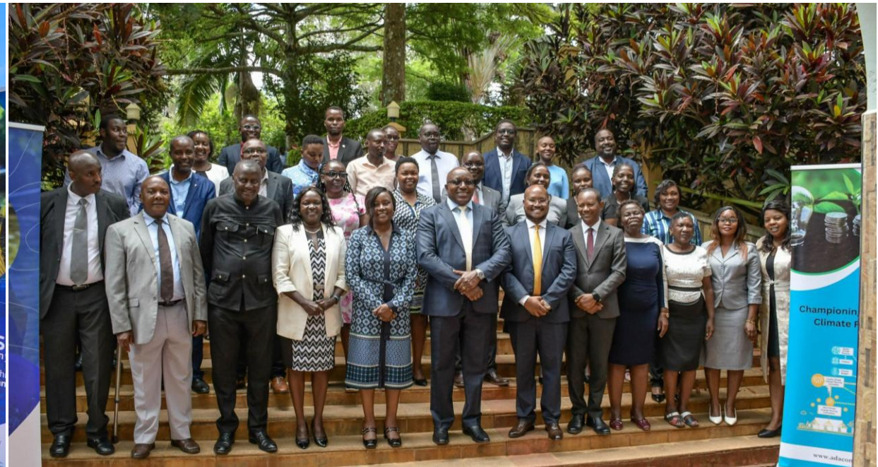
Meeting with the Embu County Government Leadership led by Governor, H.E. Hon. Cecily Mbarire and Deputy Governor, H.E Justus Kinywa Mugo.